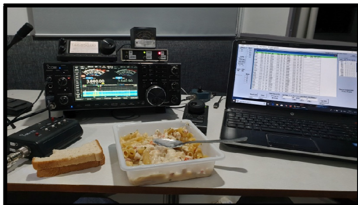
Rob, VK2MT roughing it.

(6 th Place SO Ph) Good effort for a portable station.