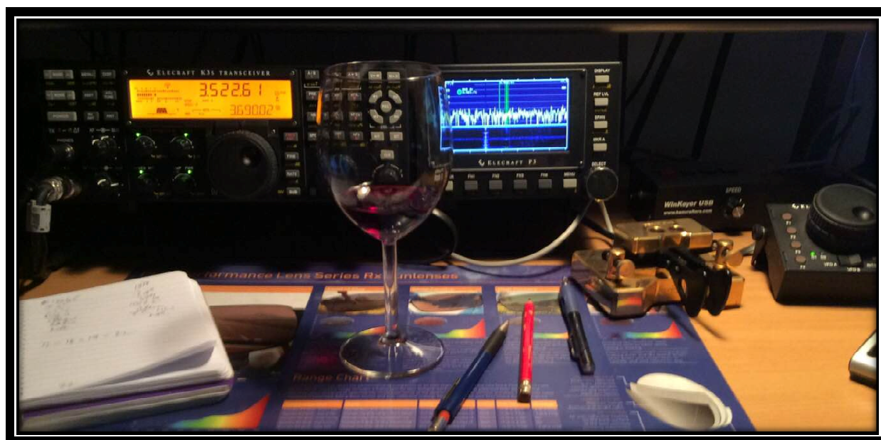
2 nd place Single Op CW - Patrick, VK2PN's Op desk

(6 th Place SO Ph) Good effort for a portable station.